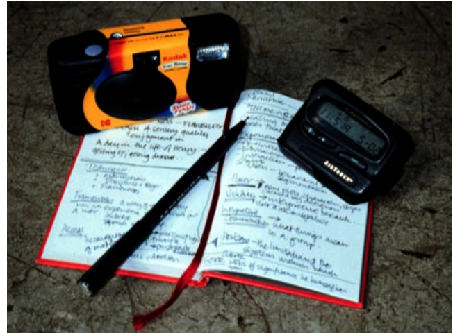
Figure 1: The patient's experience kit . When participants were paged this indicated that they had received a defibrillating shock; they recorded their surroundings with the camera, and noted their impressions.

exercise, team discussion about personal experiences ranged from anxiety around everyday activities like holding an infant son or working with power tools, to social issues about how to communicate to onlookers what was happening and how to get proper medical help.