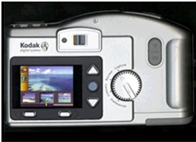
Figure 7: Kodak Digital Science DC 210 . This was the first in a series of Kodak digital cameras which embodied the interaction architecture and response qualities illustrated by the Experience Prototype.

This example perfectly demonstrates the importance of motivating and exciting a decision-making audience by providing them with a stimulating, hands-on experience. Knowing the audience and their expectations helps determine the resolution and fidelity of a prototype. Also care needs to be taken to explain its specific intent when an audience is not familiar with this particular form of prototyping. In this digital camera example, the design team built the Experience Prototype with enough flexibility for it to endure many iterations of refinement on the way towards the desired user experience. The designers were creating a prototyping platform where the hardware components were carefully chosen and built to last. The software environment was established in a modular architecture, so that simple code changes would not affect the artifact's behavior in other modes. The client however, was so impressed by the hands-on experience, that some of the design details which were compromised by time pressure, were ignored and the design phase was announced as completed directly following the presentation!