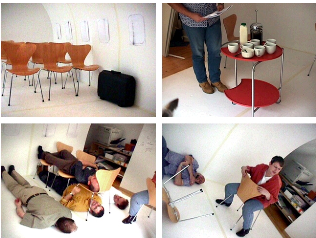
Figure 4: Bodystorming layouts for an airplane interior. Ideas were generated and evaluated rapidly by the team as they directly experienced physical and social issues in this full-scale environment.

Again, many ideas for physical configurations could be tested in a time and money efficient manner. Additionally, the involvement of the whole design team created a common focus and a shared ownership of the design directions chosen for further development.