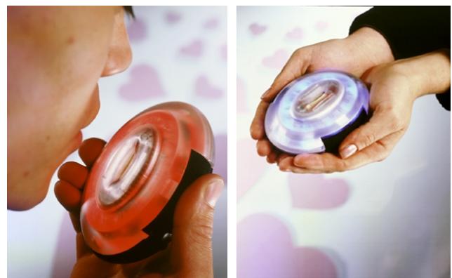
Figure 8: The Kiss Communicator . This pair of prototypes let people have the hands-on experience of creating, sending and receiving subtle sensual messages. Video helped to create an appropriate context.

There are some important conditions necessary to really appreciate the experiencing of this prototype: an intimate relationship, two distant people, sending a gesture, etc. Now imagine sharing this concept with clients in their business suits in a conference room. To help set the scene for the experience in this formal context the designers now usually preface the hands-on experience of the prototype with a short video sequence which shows a pair of the devices being used by a dreamy couple who are working apart. Using conventional devices like soft focus and a romantic soundtrack, the video creates, at least temporarily, an atmosphere that is more appropriate. This situation exemplifies how traditional and more passive communication techniques (like video) and Experience Prototypes can work hand-in-hand, with the goal of sharing a new user experience with an audience.