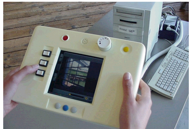
Figure 6: Digital camera interaction architecture prototype . The prototype used a desk-top computer's processing power to manipulate the dynamic qualities of the control system and screen behavior.

This Experience Prototype contained a small video camera attached to a small LCD panel, encased in a box. The size of the LCD panel was determined by the desired resolution, rather than by the desired physical size, in order to maintain the key aspects of the proposed user experience. The working prototype was accompanied by an appearance model to communicate the appropriate size and detailed formal aspects of the design solution.