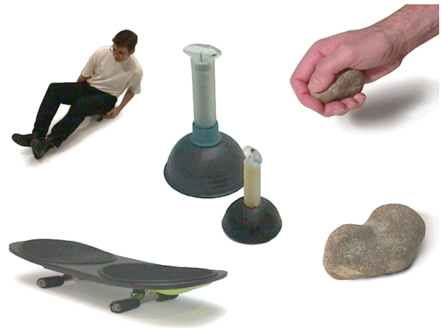
Figure 3: Control in an immersive video environment. Early in the project, the team played with a range of everyday objects to explore what different levels of physical involvement might feel like.

Simply "playing" with these relatively crude props was a powerful method, enabling the designers to unveil the nuances and implications of each particular direction.