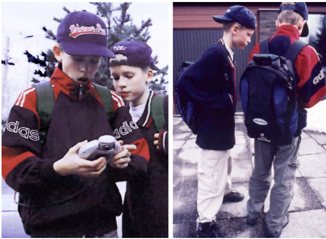
Figure 5: Picture-communicating prototype . Despite heavy backpacks containing batteries and drivers for the prototypes, the children were happy to integrate picture-sending and receiving into their daily activity.

These prototypes required a power pack and transceiver unit that the children had to carry around in a backpack, yet the experience of being able to take pictures and send and receive them to and from friends proved so compelling that the users almost forget about that inconvenience.